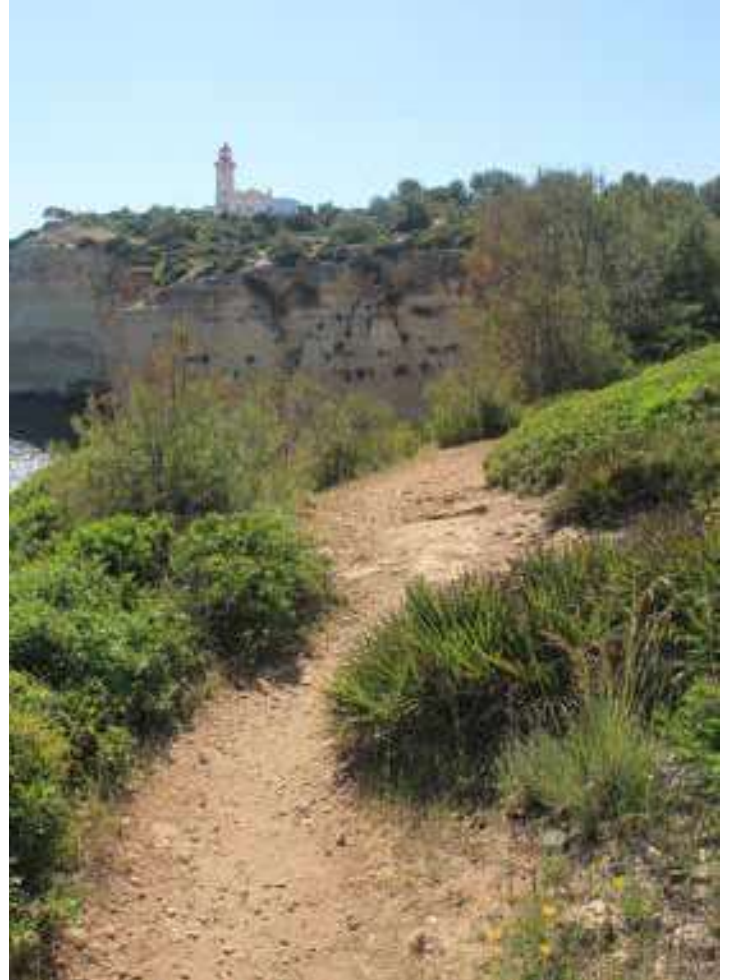
Path on top of the cliff, heading towards the Alfanzina Lighthouse

D – After the deep green of Mediterranean vegetation comes a lunar landscape of naked, bare rock. Old legends are told about this great boulder, the Leixão do Ladrão, such as that of the Moorish princess who mourns the death of her lover, her tears create the paths and tracery so typical of limestone.