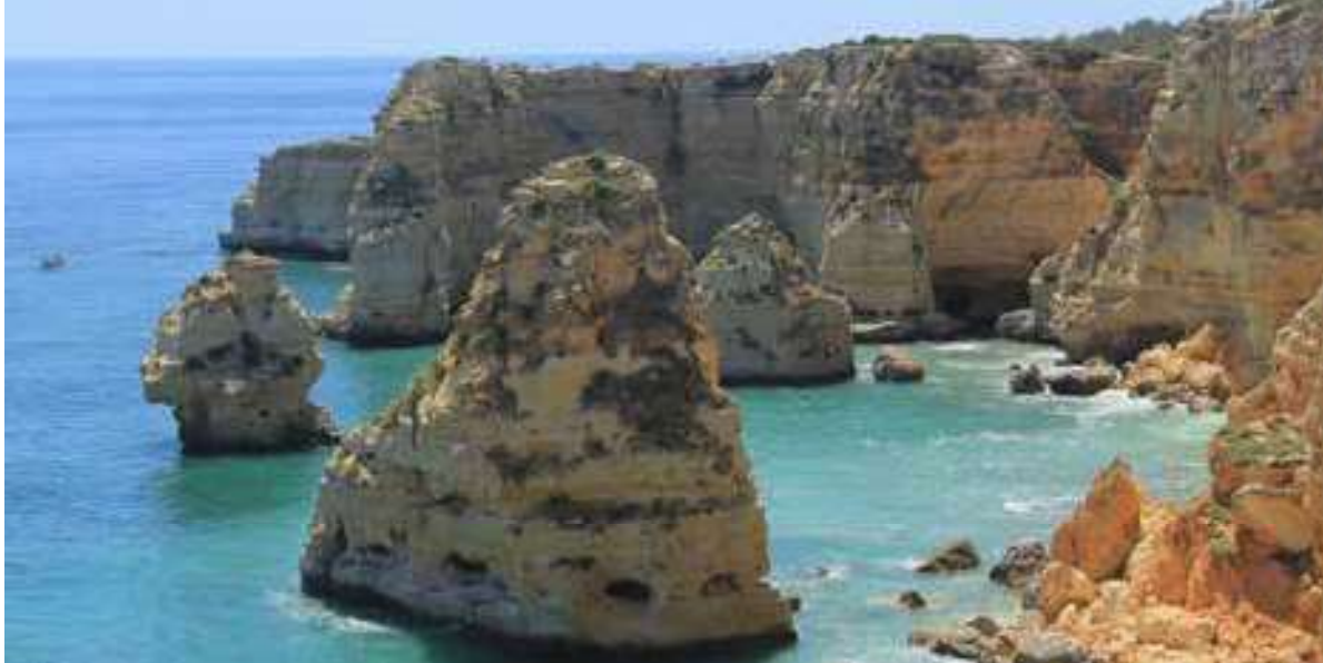
Karst landscape of Marinha beach